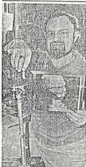
NUCLEAR PHYSICIST Stanton Friedman holds an image of a visitor from outer space. The mind-boggling model was made from the recollections of a man under hypnosis. "Visitors from the cosmos visit with us more than we know," said Friedman.

FUNERAL MIX-UP: Dog cremated while master is buried in pet cemetery